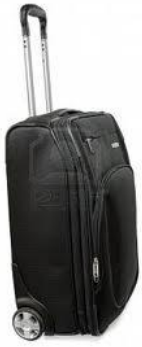
Suitcase with Wheels